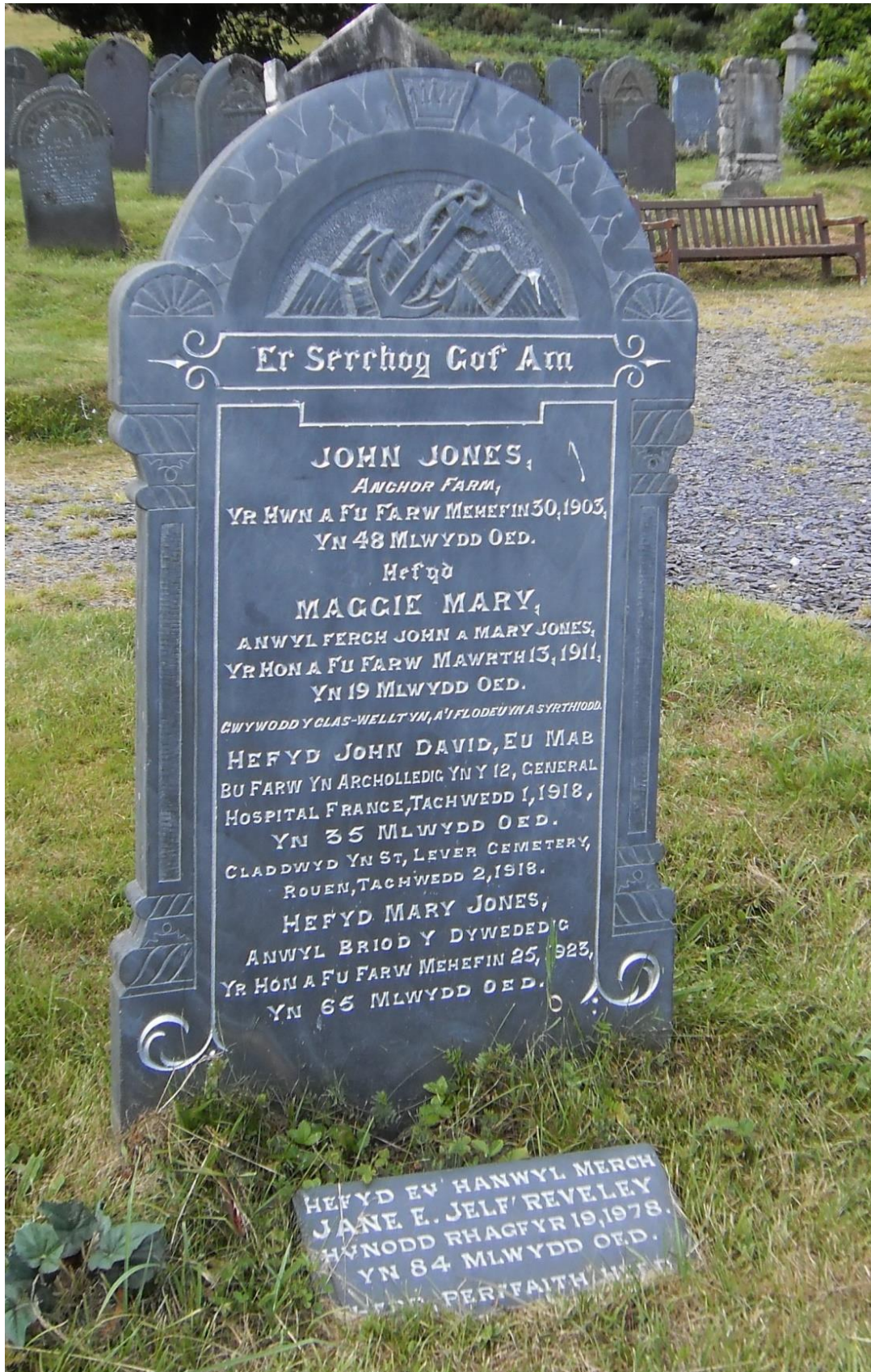
The Jones Family Grave in Trefriw Cemetery